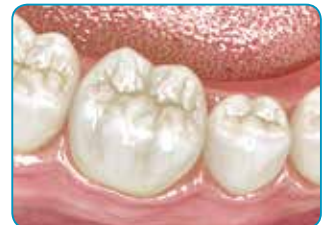
Final result after covering with a conventional composite