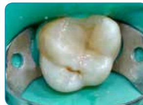
Final layer with G-aenial Universal Injectable (A3 shade)