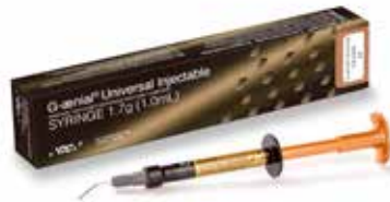
G-aenial Universal Injectable High-strength injectable restorative