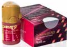
G-Premio BOND Universal bonding agent