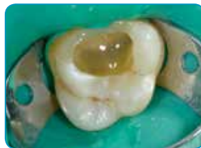
Application of everX Flow (Bulk shade)