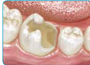
Prepare the cavity

Dentin shade for highly aesthetic results