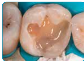
Application of everX Flow (Dentin shade)