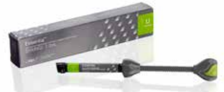
Essentia Universal Universal paste composite

everX Flow, Essentia, G-Premio BOND and G-aenial Universal Injectable are trademarks of GC. Filtek Bulk Fill Flowable, SDR flow+ and Tetric EvoFlow Bulk Fill are not trademarks of GC.