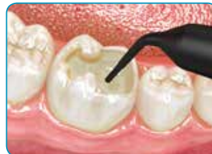
Fill the cavity with everX Flow