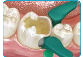
In case of a Class II cavity, build the missing walls with a conventional composite