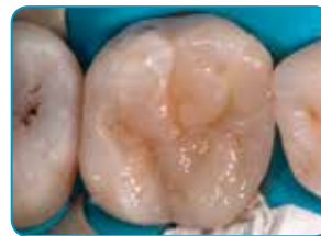
Final layer with Essentia (Universal shade)